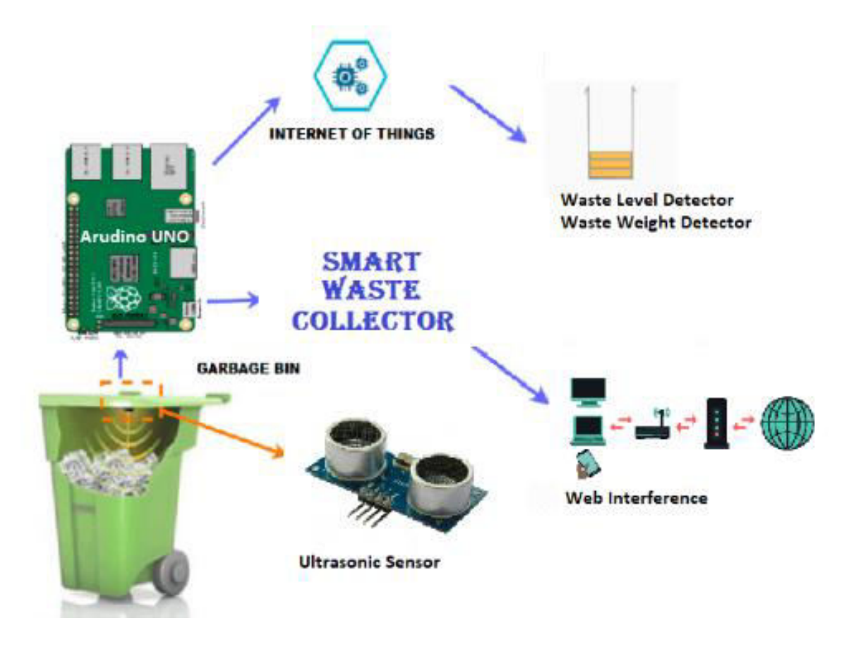
Figure 1 Graphical Presentation of Framwork

a website page. The ESP8266 Wi-Fi Module is an independent SOC with a coordinated TCP/IP convention stack that can give any microcontroller access to your Wi-Fi module.